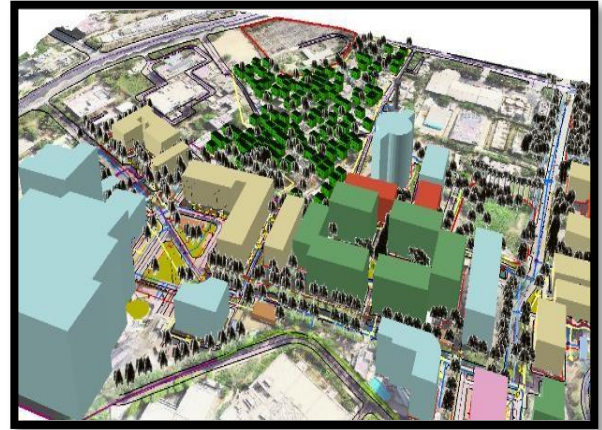
Fig 2 GIS based 3D Modelling for MIDCs Millennium Business Park, Mahape.

model expresses terrain features in an intuitive way which enhances the management and analysis of a proposed project through 3D visualization.