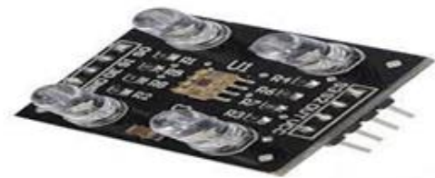
Fig 3. Colour sensor

In each situations, the received candlepower of red, blue and green inexperienced are detected, and therefore the quantitative relation of sunshine received is calculated.