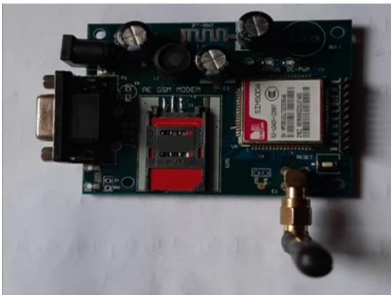
Fig 5. GSM module

It is a hardware device that uses GSM technology to establish an information link to a far off network. It is a second generation technique that uses Time Division Multiple Access technique. It uses 850MHz, 900MHz, 1800MHz and 1900MHz frequency bands for transmitting mobile voice and data services. It digitizes the data and sends through the channel in two streams within a particular time slot. It can carry data rates of 64kbps to 120 mbps.