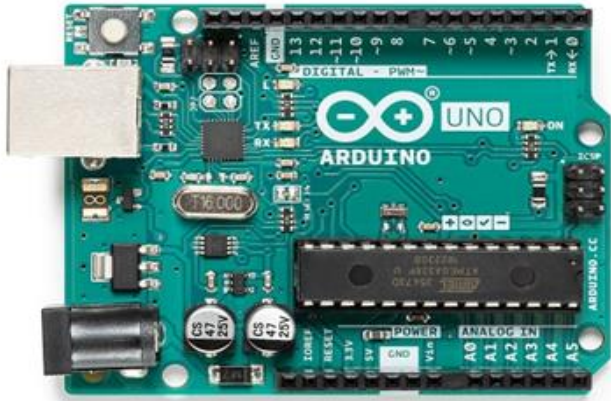
Fig 1. Arduino Uno

interface to various expansion boards and other circuits.