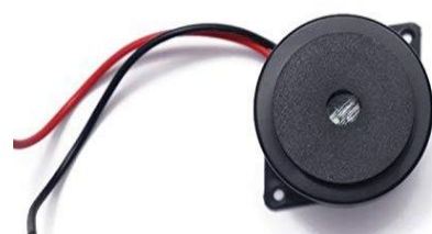
Fig 4. Buzzer

Buzzer or pager is an audio signalling device, which can be mechanical or electro mechanical or piezoelectric. Typical uses of buzzers and beepers embody alarm devices, timers, and confirmation of user input like a click or keystroke. The current consumed by the buzzer in electronic applications is as low as 30mA.