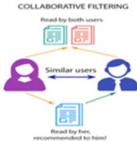
Fig. 2.2: Collaborative Filtering[7]

Collaborative filtering is commonly used for data that cannot easily be described by attributes from the dataset such as books and movies. First, the prediction technique builds a user-item matrix of preferences for items by users. It then matches users by computing the similarities between their data and makes recommendations.