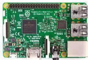
Fig -1. Raspberry Pi 3B Model

It is a single-board computer system developed by Raspberry pi foundation, it can be used for a wide range of operations. It has a diverse range of models with different hardware features We have used 3B model.