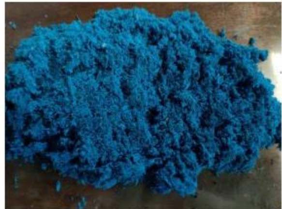
Fig 1. Pulp

After roller pressing the uniform shape of paper is not obtained. To obtain uniform shape shearing off operation is necessary, hence by cutting the paper from all the sides manually the uniform shape of the paper can be obtained.