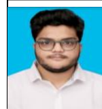
Student at D. J. Sanghvi College of Engineering (production engineering)