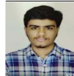
Student at D. J. Sanghvi College of Engineering (production engineering)