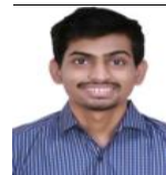
Student at D. J. Sanghvi College of Engineering (production engineering)