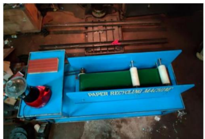
Fig -3: Actual Assembly (T.V)