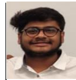
Student at D. J. Sanghvi College of Engineering (production engineering)