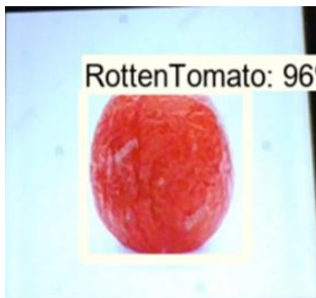
Fig 3: Rotten tomato of 96%