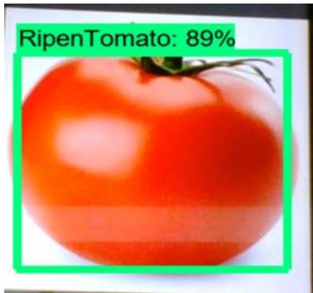
Fig 2: Ripen tomato of 89%

The dataset is created by the author. It contains 7 class of fruits. The neural network model which have been used for dataset. For the proposed recognition model evolution this paper organized this recognition model using its training and test images. For this test, the training image for each fruit was 1260 and test images were created from detection set of using this fruit classification approach.