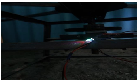
Fig 7.2: Load connected directly to the generator