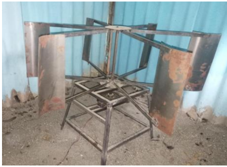
Fig 7.1: Experimental setup