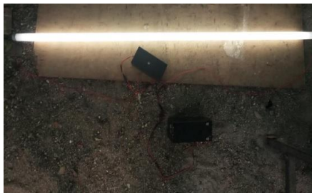
Fig 7.3 : Load after charged from battery