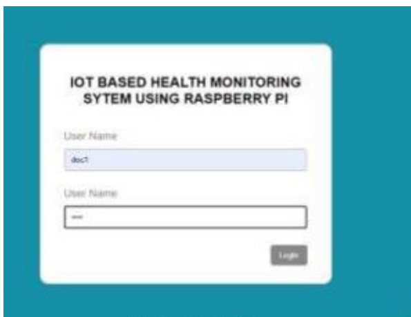
Fig. 1c: Login Page

The users of the application are authenticated using registration and login. The results of the model are attached here the data will be collected from the sensors continuously. If the condition of the patient goes abnormal notifications will be sent to the doctor immediately. The complete prototype of the health monitoring system with the sensors are shown in Figures, where it shows the output parameter of the sensors computed and shown on LCD display, so that these output parameters are visible even to the patient.