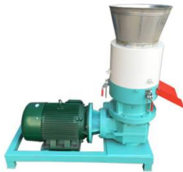
Fig3.4.1. Pellet Machine