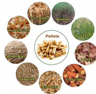
Fig3.2.1. Pellet materials

The recent advancement in technology and research had helped bioenergy to achieve new heights but still the gap between bioenergy efficiency and renewable energy source efficiency remain big. Consider coal which have kcal/kg value ranging between 4800-7000 and standard biomass pellet have kcal/kg from 3500 to 4200. The energy to volume ratio is also less as compared to coal. One of the major difficulties in using biomass pellet is transportation due to less durability nearly 10% of total biomass breakdown resulting in less efficiency. To avoid this we have used wax to cover it with thin wax so that durability is increased.