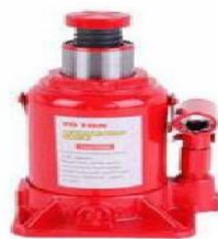
Fig.no:2 Bottle Jack

Bottle jack are suitable for personal use. Bottle jack have loin shaped lift surface. In a bottle jack the position of piston is vertical and directly supports a bearing pad that contacts the object being lifted. With a single action piston the lift is somewhat less than twice the collapsed height of the jack, making it suitable only for vehicles with a relatively high clearance.