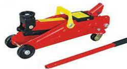
Fig.no:1 Trolley Hydraulic Jack

The hydraulic trolley jack are consider to be very safe. Trolley jack are very common and expensive but if well cased it can last very long period. Trolley jack are quicker and easier to use it is simply a case of inserting the handle and pumping it until this cradle reaches the jacking point. To lower it back down, take the handle out and twist the little lever anti clockwise, taking care to do so steadily to lower the car slowly.