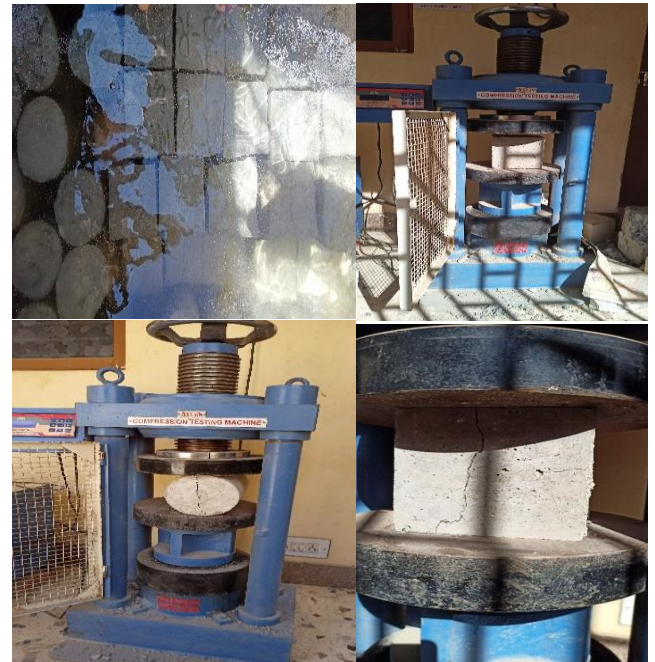
Fig-6.1 Testing of Specimen