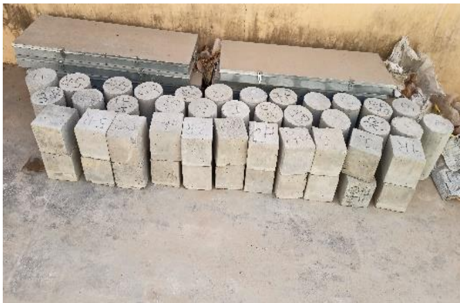
Fig-5.1 Casting Process