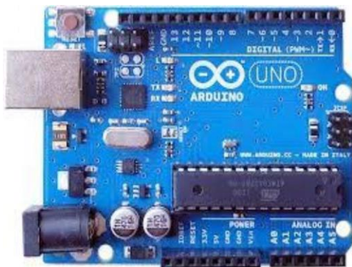
Fig-2: Arduino Uno R3