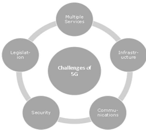
Fig -2: Common Challenges in 5G