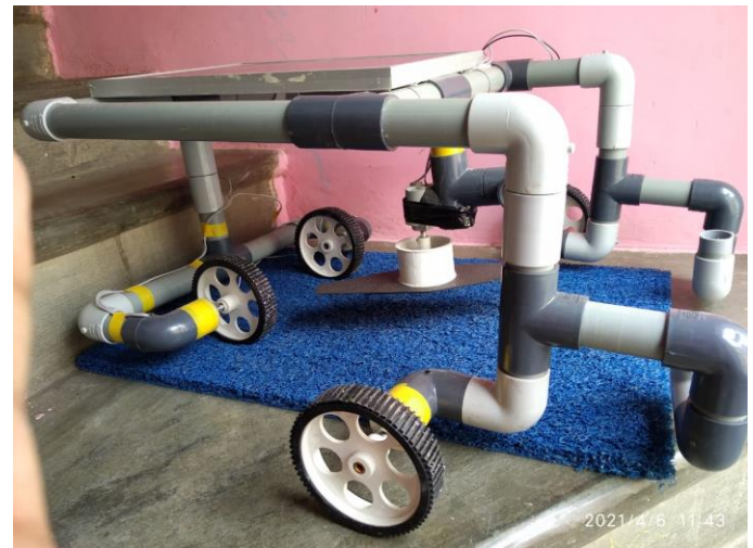
Fig-3: Experimental Setup

The solar panel gets energized by obtaining energy from sun which is helpful to charge the battery whenever necessary. The motor works according to the supply from the battery. The two motor drivers are connected in between the motor. Once the power gets transmitted to the device, the motor shifts from OFF to ON position and in turn the blades get started to cut the grass according to the users design.