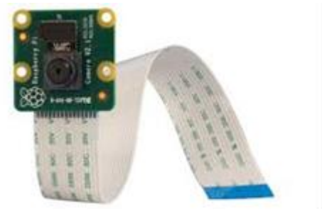
Fig - 2: Pi camera

The Pi's camera element is fundamentally a mobile phone camera element. Mobile phone electronic cameras varies from immense, much extravagant, cameras (DSLRs) in some regards. The major influentially of these, for deciding the Pi's camera, is that many mobile cameras (including the Pi's camera device) use a rolling shutter to capture images. When the camera requires to encapsulate an image, it skim out pixels from the sensor a row at a slot rather than capturing all pixel rate at once.