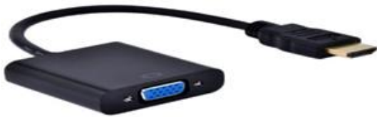
Fig -3: HDMI (High-Definition Multimedia Interface)