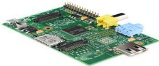
Fig -1: Raspberry pi