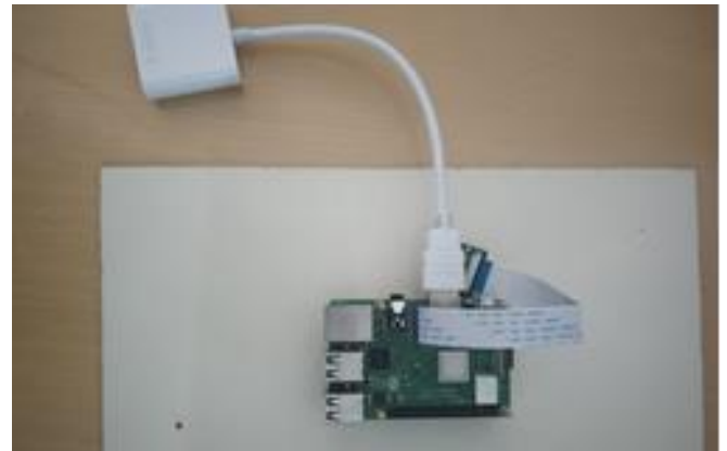
Fig -6: Output Setup