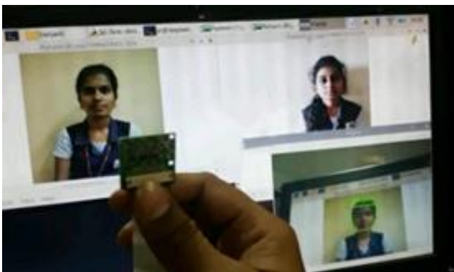
Fig -4: Trained faces

1. Initially the person is detected with a camera for the wearing of mask, as the faces has to be trained as follows,