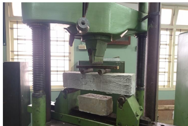
Fig-5 Prism in Test Setup

The conventional prism is casted and tested of specified dimension (100*100*500mm). The testing based on gradually fumed silica adding to the cement to prism. From the above results, the various percentage fumed silica of Self Compacted concrete prism in curing is discussed. The compressive strength of control concrete and Self Compacted concrete with 1% fumed silica addition to cement after 28 days. It concluded that Self Compacted concrete with 1% addition to cement gives more flexural strength when compared to control concrete.