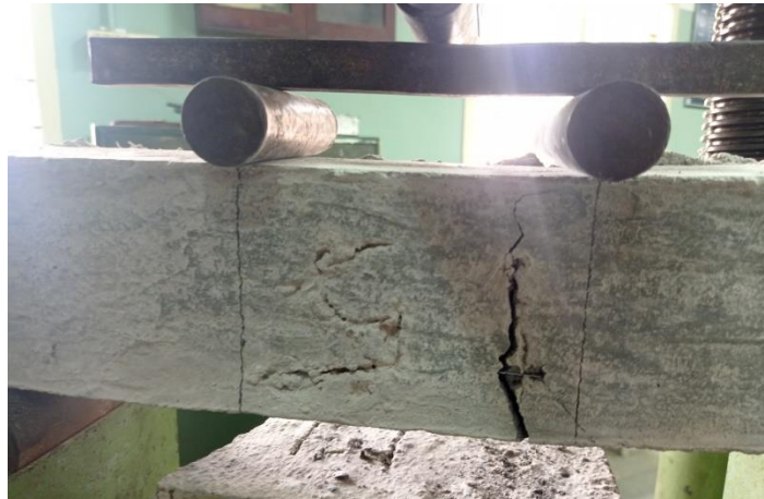
Fig-6 Failure mode of Prism