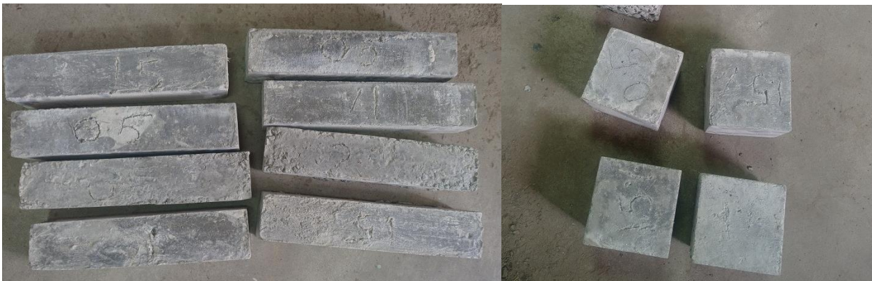
Figure-2 Casted Specimen

The specimen of cube is casted in the size of 150 x 150 x 150 mm and prism was 100 x 100 x 500 mm imported on testing machine.