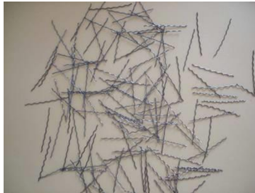
Figure-1 Corrugated steel fiber

given more strength, ductility to concrete. Steel fibres are available in lengths between 6 and 80mm and with a cross sectional area between 0.1 and 1.52mm. The tensile strength is normally in the range between 300 and 2400Mpa.