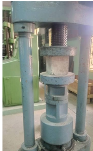
Fig-3 Cube in Test Setup

The conventional cube is casted and tested of specified dimension (150*150*150mm). The testing based on gradually fumed silica adding to the cement to cube. From the above results, the various percentage fumed silica of Self Compacted concrete cube in curing is discussed. The compressive strength of control concrete and Self Compacted concrete with 1% fumed silica addition to cement after 7 & 28 days gives more compressive strength when compared to control concrete.