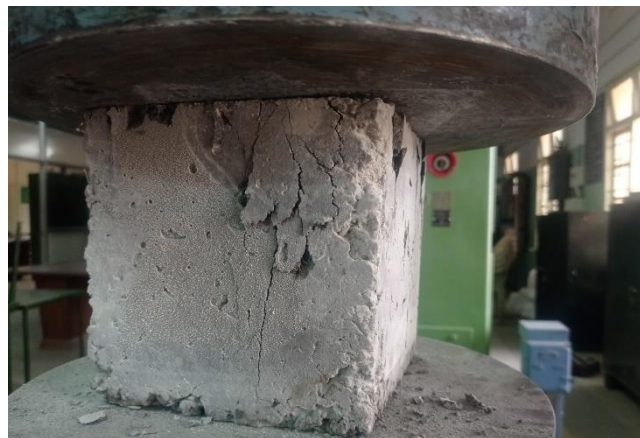
Fig-4 Failure of Cube