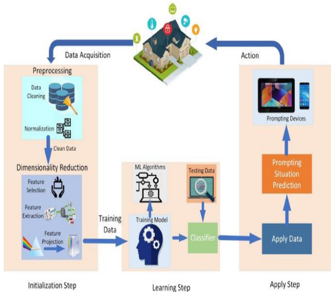
Fig - 1: Framework of Proposed SB Model

Fig - 1 represents the basic framework of the project model. It is a general depiction of ML tasks in SBs and tells about the steps taken to implement ML in an SB environment.