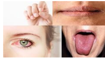
Fig -1: Sample Dataset Images (Nails, Lip, Eyes, Tongue)

A simple Android Application are often designed to prompt the user to capture photos of the mentioned organs. An intelligent application is often built to accumulate, process, analyze and extract the features of interest from these photos. to make a platform capable of this task, Machine Learning algorithms were wont to train a Neural Network for symptoms detection. Since Fully Connected Neural Network can't be wont to perform analysis on A \times B \times 3 colored images (in which A \times B is pixel density and three is that the number of color channels in matrix representation) thanks to the large number of weights created within the first neural layer which can hamper the training process, Convolutional Neural Network (CNN) is employed to coach the neurons thanks to its effective efficiency. Arrays with different pixel weights representing the color scale between -1.00 and 1.00 are used as filters by convolved multiplication across the target photo array. The summation then is split by the entire number of pixels within the filter to supply an output weight value for subsequent convolutional layer. Similarly speaking, the Sigmoid Squishification Weight Activation Function was replaced with Rectified linear measure (ReLU) to asses with the speed and accuracy [20] of the propagation process by removing the negative values that represent dissimilarities between pixels. A bias is often added to elevate the activation range.