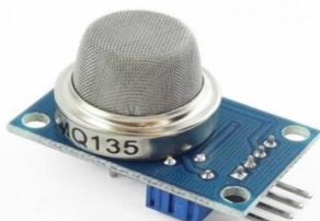
FIG 2 MQ-135 GAS SENSOR

MQ135 Gas Sensor is an air quality sensor for detecting a wide range of gases, including NH 3 , NO x , alcohol, benzene, smoke and CO 2 . MQ135 gas sensor has high sensitivity to Ammonia, Sulfide and Benzene steam, also sensitive to smoke and other harmful gases. Ideal for use in office or factory.