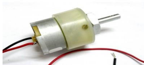
FIG 4 12V DC MOTOR

The speed of a DC motor is controlled using a variable supply voltage or by changing the strength of the current within its field wind rings. While smaller DC motors are commonly used in the making of appliances, tools, toys, and automobile mechanisms, such as electric car seats, larger DC motors are used in hoists, elevators, and electric vehicles. A 12v DC motor is small and inexpensive, yet powerful enough to be used for many applications. Because choosing the right DC motor for a specific application can be challenging, it is important to work with the right company.