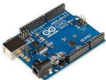
FIG 3 ARDUINO UNO BOARD