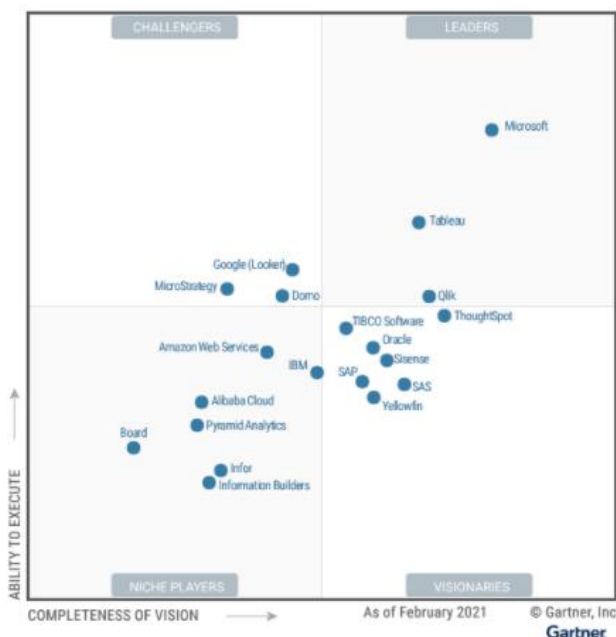
Fig. 3 Gartner's Magic Quadrant of BI Systems

As per latest review by Gartner on February 2021 (Fig. 3) Tableau, Qlik and Microsoft Power BI retain their place within the Magic Quadrant leadership category, this could be in line with our expectations. All of those tools are extremely popular within the Business Intelligence industry and it is seen that many organizations use these tools. [2]