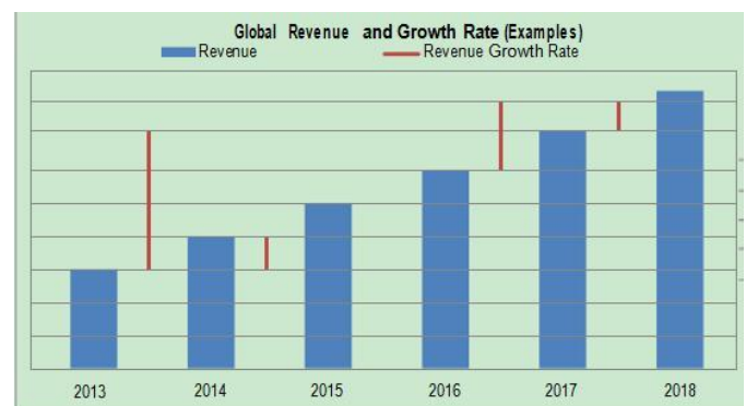
Fig-1 :- Growth rate of mobile phone users

These problems have been identified by many researches over the years and taken action to solve them. There are numerous apps regarding pet adoption. The main problems with these apps are that they only focus on pets like dogs and cats, rest of the animals such as rabbits. There are no filters for animals and their breeds too. So in our application prototype we overcame these inefficiencies.