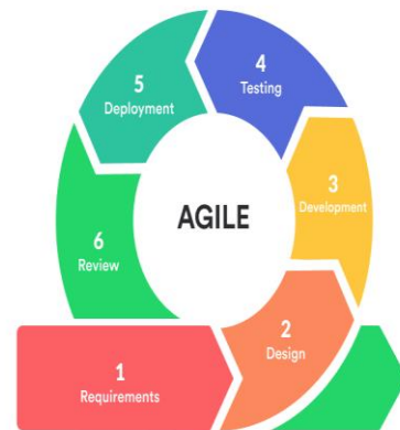
Fig-3 :- Agile Development Model

This project is developed using Agile Development Model. This model has focuses on iterative development. Agile methods or Agile processes generally promote a disciplined project management process that encourages frequent inspection and adaptation, a leadership philosophy that encourages teamwork, self-organization and accountability, a set of engineering best practices intended to allow for rapid delivery of high-quality software, and a business approach that aligns development with customer needs and company goals.[2]