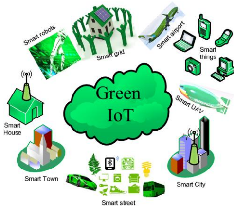
Fig.1 Green IoT

Green IoT has three ideas, to be specific, plan advances, influence advances and empowering advances. Plan innovations allude to the energy proficiency of gadgets, correspondences conventions, network models, and interconnections. Influence innovations allude to cutting fossil fuel byproducts and upgrading the energy effectiveness. Because of green ICT advances, green IoT turns out to be more effective through diminishing energy, lessening perilous emanations, decreasing assets utilization and diminishing contamination. Thusly, Green IoT prompts protecting characteristic assets, limiting the innovation sway on the climate and human wellbeing and lessening the expense essentially. Accordingly, green IoT is surely zeroing in on green assembling, green use, green plan, and green removal [9].