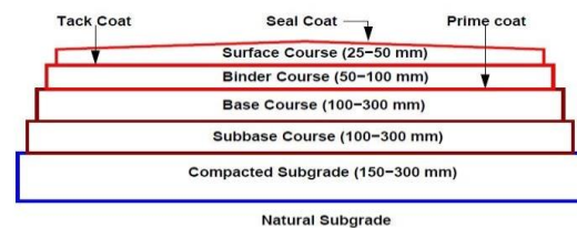
Typical cross section of a flexible pavement

In simple terms, a flexible pavement can be defined as a pavement layer comprising of a mixture of aggregates and bitumen, heated and mixed properly and then laid and compacted on a bed of granular layer.