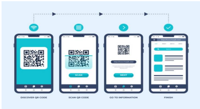
Fig 2: QR Scanning process