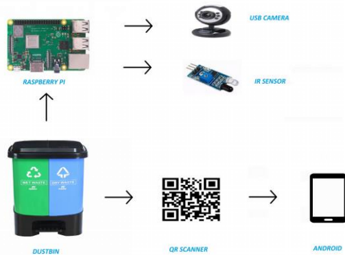
Fig 3: IOT Based Smart Dustbin