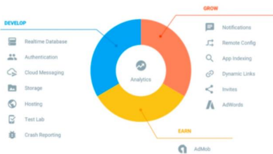
Fig 4: Firebase services.

The Firebase console is a Realtime Database is more like a category of cloud-Based NoSQL database server that lets you to store and synchronize between your data and your users in realtime server. The Realtime Database consists of one big JSON object that the developers can manage their application and runtime application in realtime process