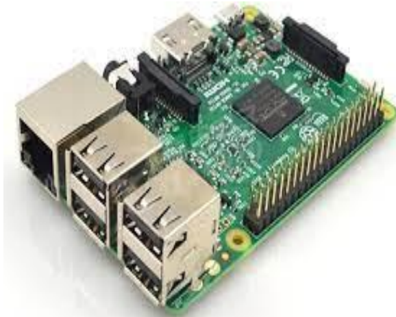
Fig 3: Raspberry PI

In an infrared detection system there are five elements namely: a transmission medium, an infrared source, infrared detectors or receiver, optical component and signal processing. Infrared sources with particular wavelength is uses in IR lasers and Infrared LED's