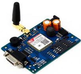
Fig -5.2.1: GSM Module

A GSM module or a GPRS module is a chip or circuit that will be used to establish communication between a mobile device or a computing machine and a GSM or GPRS system