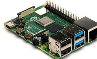
Fig -5.2.1: Raspberry Pi