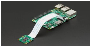
Fig -5.2.2: Raspberry Pi

The Raspberry Pi Camera Module v2 replaced the original Camera Module in April 2016. The v2 Camera Module has a Sony IMX219 8-megapixel sensor (compared to the 5-megapixel Omni Vision OV5647 sensor of the original camera). It attaches via a 15cm ribbon cable to the CSI port on the Raspberry Pi.