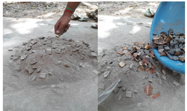
Fig -4: Mixing the concrete

It is planned to cast 42 cubes of size 150mm x 150mm x 150mm for the compressive strength test and 42 prism of size 100mm x 100mm x 500mm for the flexural strength are to be used as per IS provisions. Average result specimens for all above parameters are to be considering in main results. In this study we replace of 20 mm coarse aggregate with pieces of coconut shells and bamboo.it will cast in given correct percentages. At last, the curing period is completed the cubes and prisms will be testing and take a result.