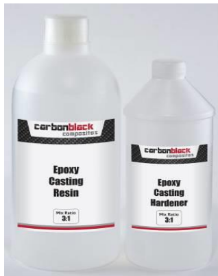
Fig -3: Epoxy Resin