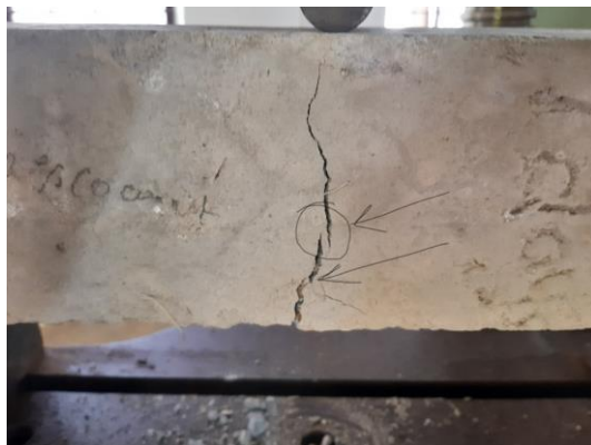
Fig -10: specimen loading to cracks formed