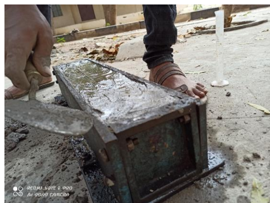
Fig -5: casting