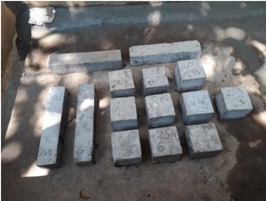
Fig -6: cubes and prisms Ready for testing