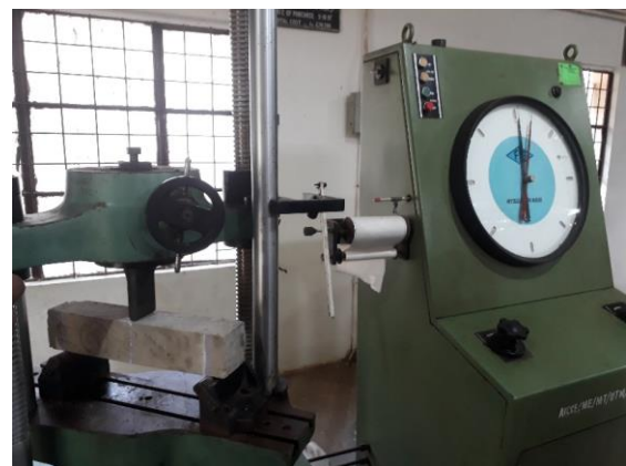
Fig -9: Test Setup to check Flexural Strength