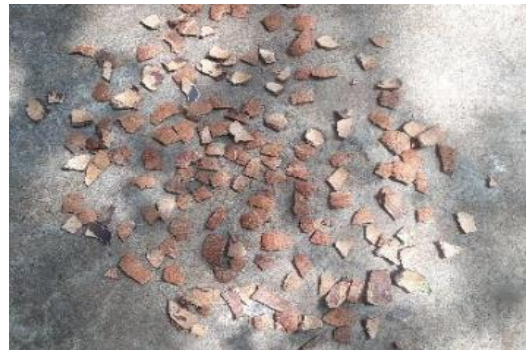
Fig -1: coconut shells

Coconut shell is an abundantly available waste material which can be used as potential or replacement material in the construction. Coconut shell passing through 20mm IS sieve and retaining on 12.5mm IS sieve. Coconut shell are soaked in water for 24hours and then used in concrete as coconut shells have more water absorption than coarse aggregate.