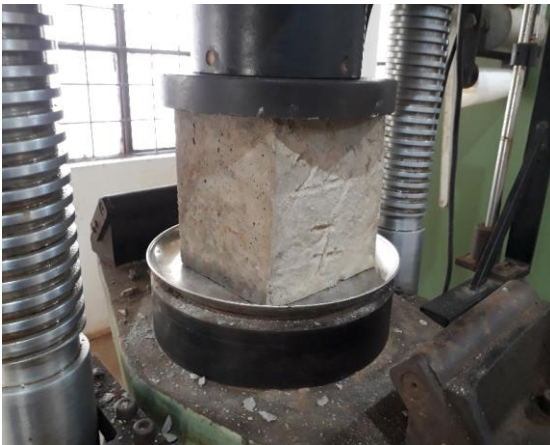
Fig -7: Test Setup to check Compressive Strength