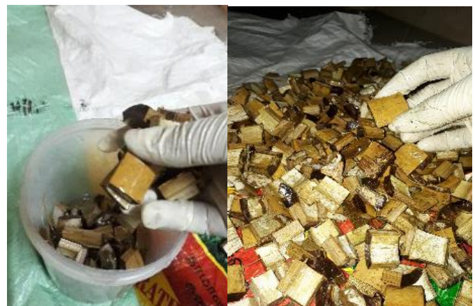
Fig -2: Bamboo pieces

Bamboo, as species of plant in the grass family possessing good strength and flexibility and can be used as building material. Bamboo fibres with size of varying length from 2 to 3 cm, breadth from 1 to 2 cm, and thickness of 1 to 1.5 cm is also used as replacement of coarse aggregate at the replacement percent of 10% and 20%. The physical properties of all these materials were tested as per IS 383-1970.