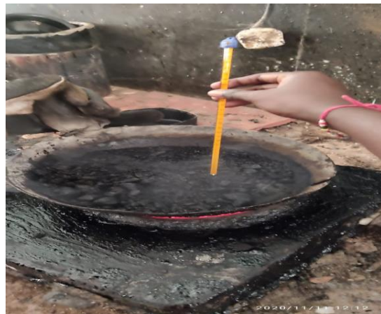
Figure -2: Temperature of Mixing of constituents