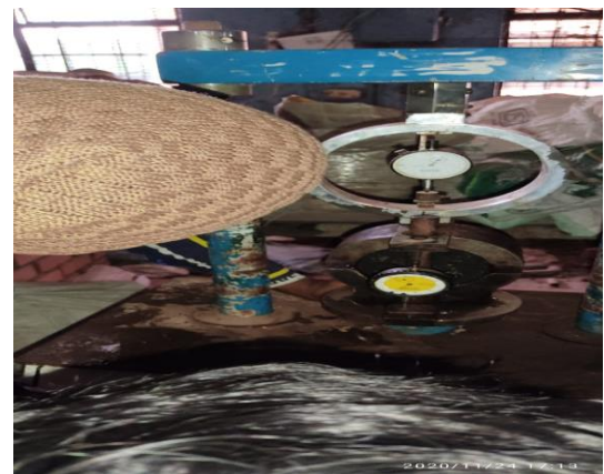
Figure -3: Testing of Marshall specimen

The Optimum bitumen content for the mix design is found by taking the average value of the following three bitumen content found from the graphs of the test results. Bitumen content correspond to maximum stability, 4% air void, and maximum bulk density.