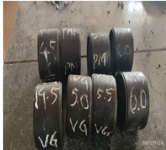
Figure -1: Marshall specimen prepared