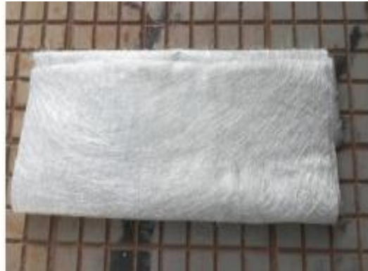
Figure 2. GFRP sheet