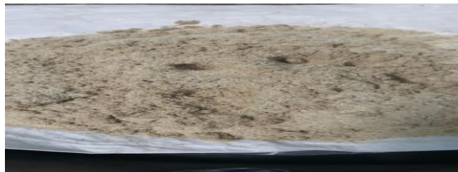
Fig.1 Mixing of Sawdust with Jaggery Mixer