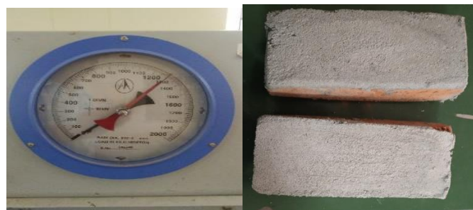
Fig .4 Compressive Strength Testing

The above table shows the Compressive load applied on test specimen in kilo Newton (kN) which will be the primary factor to calculate the compression strength of bricks.