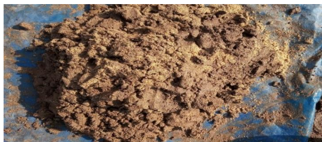
Fig.2 Mixing of Clay Sawdust with Jaggery Mixer