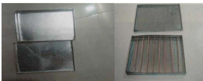
Fig -3: Module with Fins and Without Fins

The Fins is attached to the module at an equal space as shown in fig.