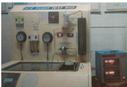
Fig -1: Ice Plant Test Ring

• Data acquisition system: Data Acquisition System is the process of sampling signals that measure real world physical conditions and converting the resulting samples into digital numerical value that can be manipulated by a computer.