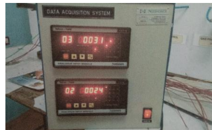
Fig -2: Data Acquisition System

Here data acquisition system is used to measure temperature variation in phase change material with respect to time.