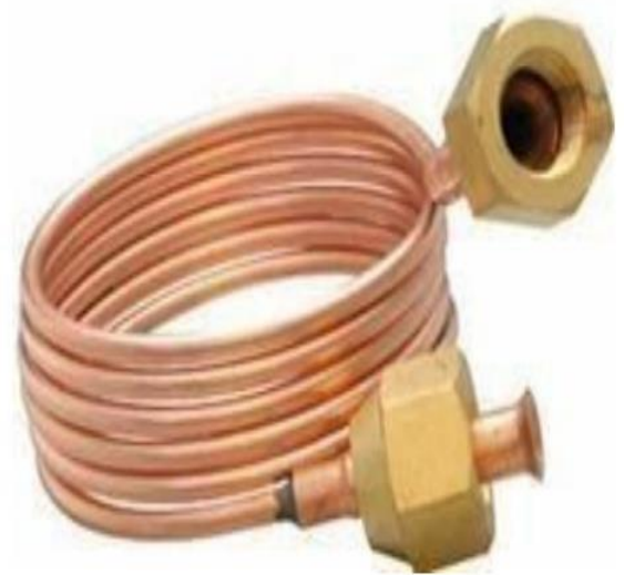
Fig -2: Capillary tube

Smaller is the diameter and more is the length of capillary. More is the drop in pressure of the refrigerant as it passes through the capillary tube.