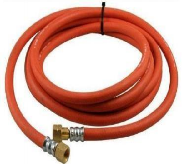
Fig 5:High pressure pipes

to both ends. Two swiveling connection nipples press these balls against the seating of the connecting hole and thus sealing against gas leakage. All pipes are pressure tested to 100 M Pa (14,500 psi) over recommended working pressure