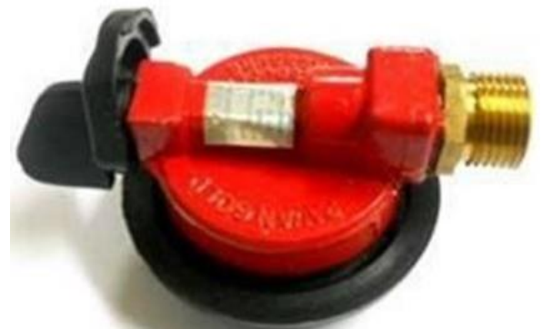
Fig 6: Pressure regulator