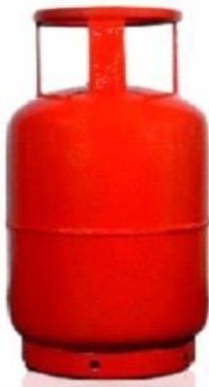
Fig -1: LPG cylinder