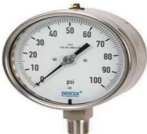
Fig 4:Pressure gauges