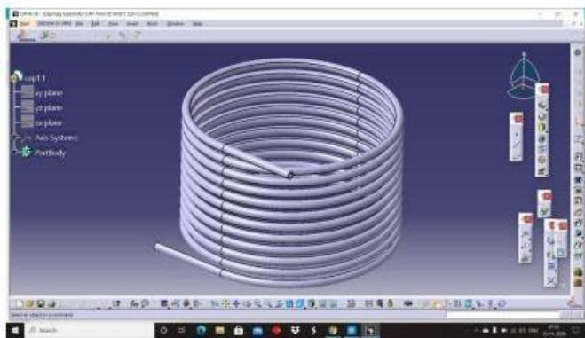
Fig 1 : Design of capillary tube on CATIA

Design of capillary tube : The capillary tube is a fixed restriction-type device. It is a long and narrow tube connecting the condenser directly to the evaporator. The pressure drop through the capillary tube is due to the following two factors: 1. Friction, due to fluid viscosity, resulting in frictional pressure drop. 2. Acceleration, due to the flashing of the liquid refrigerant into vapour, resulting in momentum pressure drop. Design parameters for capillary tube are: Cylinder size = 14 kg, Dcylinder = 295 mm dcapillary = 1.05mm