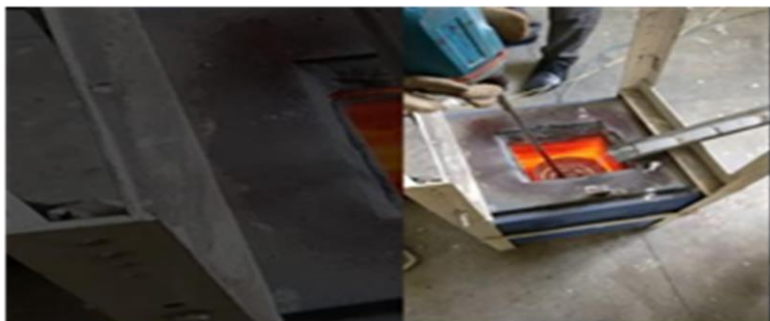
Fig 2: Stir Casting arrangement

After Stir casting process of AA 6065 and fly ash, SiC, the molten metal is poured in the die and let it to be solidification for some time and then take these blocks to cut dumbbell shaped work pieces.