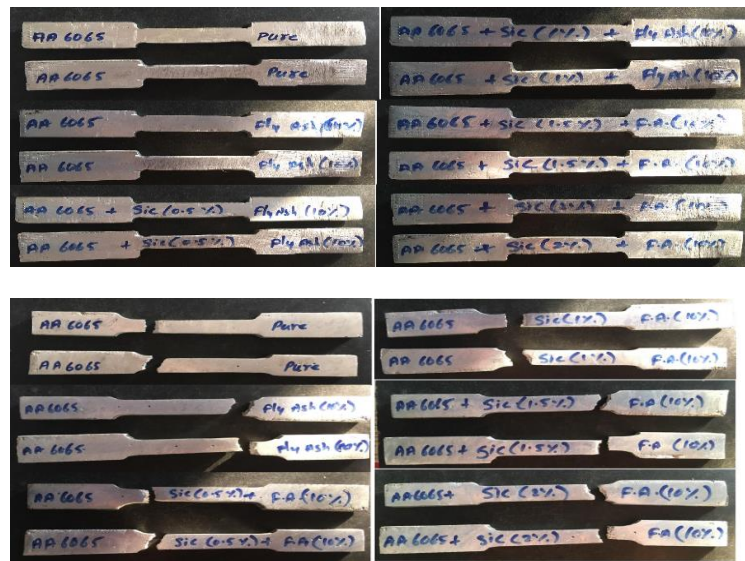
Fig 3: Work pieces before and after tensile tests

AA 6065 melted above 850 °C in a crucible and the reinforcements were preheated up to same temperature for proper mixing and oxidation removal. Preheated SiC and fly ash were mixed in the metal slurry manually at 850 °C. The molten metal poured in preheated moulds and allowed to cool. Casted metal matrix was machined to remove cluster formation on the surface and then cut into required dimension by using fan-saw cutting machine.