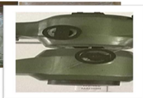
Fig 4: UTM machine