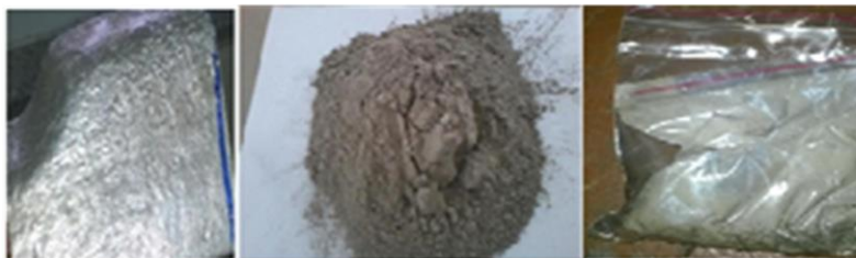
Fig 1: AA6065, Fly Ash, SiC, Mg