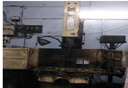
Fig: die sink EDM process