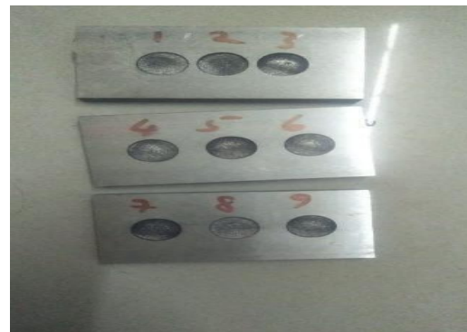
Fig: Final work piece