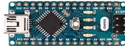
Fig -2: Arduino Nano

with 2 KB used for the boot loader. The ATmega328 has 2 KB of SRAM and 1 KB of EEPROM. Each of the 14 digital pins on the Nano can be used as an input or output, using pin Mode(), digital Write(), and digital Read() functions.