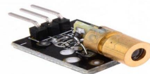
Fig -3: Laser Diode KY008