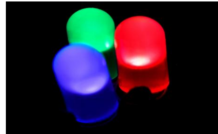
Fig -5: LEDS

energy in the form of photons. Recent developments have produced high-output white light LEDs suitable for room and outdoor area lighting.