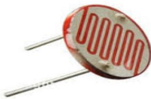
Fig -4: LDR

The most common type of LDR has a resistance that falls with an increase in the light intensity falling upon the device (as shown in the image above). The resistance of an LDR may typically have the following resistances: Daylight= 5000Ω ,Dark= 20000000Ω