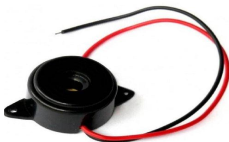
Fig -5: PIZOELECTRIC BUZZER

This buzzer can be used by simply powering it using a DC power supply ranging from 4V to 9V. A simple 9V battery can also be used, but it is recommended to use a regulated +5V or +6V DC supply. The buzzer is normally associated with a switching circuit to turn ON or turn OFF the buzzer at required time and require interval. This buzzer can be used by simply powering it using a DC power supply ranging from 4V to 9V. A simple 9V battery can also be used, but it is recommended to use a regulated +5V or +6V DC supply. The buzzer is normally associated with a switching circuit to turn ON or turn OFF the buzzer at required time and require interval.