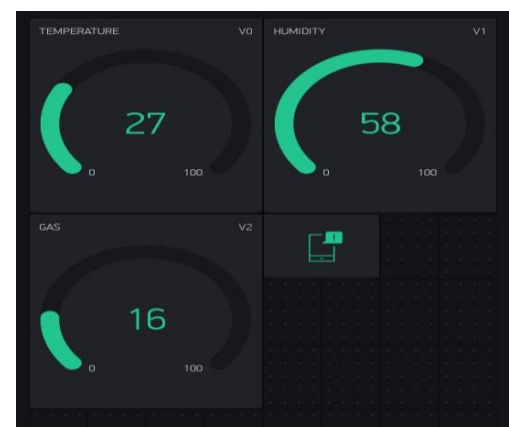
Fig: Blynk app result