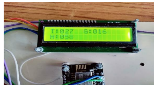
Fig: LCD display

level. As a result, people in the industries will be alerted that the temperature and humidity levels have increased. At the same time, if the temperature, humidity, or gas level rises, users will be notified via the Blynk mobile application. As a result, the Blynk mobile application will be particularly valuable for people working in sectors that need to know about changes in temperature, humidity, and gas. Industries can employ their corresponding machineries, and they can use this system according to their field and make use of it, by monitoring these elements.