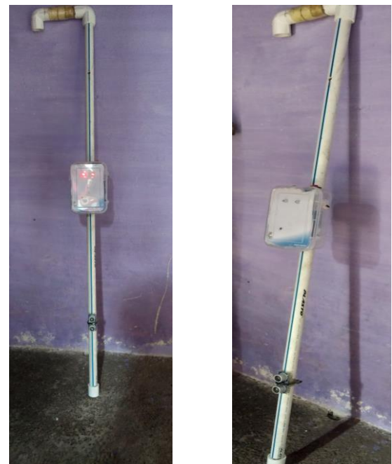
Fig 1: Outlook of Advance Smart Blind Stick

A lot of study is being done to design a fine instrument that provides the user a better walking experience. According to the famous philosopher and scientist ARISTOTLE, our knowledge about the outside the world depends on the five sense organs and sight is one of those five organs. And visually impaired are those unfortunate peoples who are completely or partially suffering from eye sight issues. According to the WHO (World Health Organization) and IAPB (International Agency for Prevention of Blindness), approximately 285 million peoples are visually impaired worldwide: 39 million are blind and 246 million have low vision (several or moderate visual impairment). But in recent time ETAs (Electronic Travel Aids) with sensors and sound systems are designed for improved navigation of blind peoples.