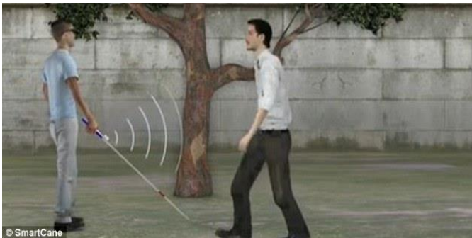
Fig 3: Working of Advanced Smart Blind Stick

The proposed of project is firstly used the ultrasonic sensor to detect the obstacle ahead using ultrasonic waves. On sense the obstacle the sensor passes the data to the Arduino board. If the obstacle is not that close the circuit does nothing, If the obstacle is close the Arduino board send the alarm units i.e piezo buzzer and ERM vibration motor. It detects and beeping the buzzer also vibrating the handle of stick. If object is closed the beeping frequency of a buzzer is increases and everything is normal the buzzer is not beep. There are switch button to start the system.