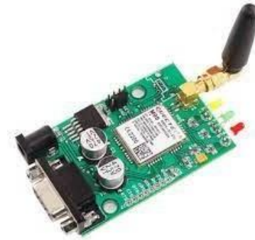
Figure 1: GSM Modem.

GSM is nothing but a Global System for Mobile Communications chip that works as a medium between mobile phone (transmitter) and display board (receiver). It was flourished by the European Telecommunications Standards Institute (ETSI). It is the main part of the whole setup. The GSM modem is linked with power supply circuitry and communication interface (RS-232) with programmable devices. It can also be linked with dedicated modem devices like input-output serial ports, USB (Universal Serial Bus), Bluetooth or mobile phone that make it more compatible to use. Each GSM module is linked with an identical mobile phone. It is also implemented for voice and data services operate at the 850MHz, 900MHz, 1800MHz, and 1900MHz frequency bands. In case of interference between two information, GSM modem uses time division multiple access (TDMA) technique that gives it different time slot for each user at same frequency to send their information. GSM modem has very wide applications in many fields such as in transaction terminals, supply chain management, security applications, weather stations, and GPRS mode remote data logging.