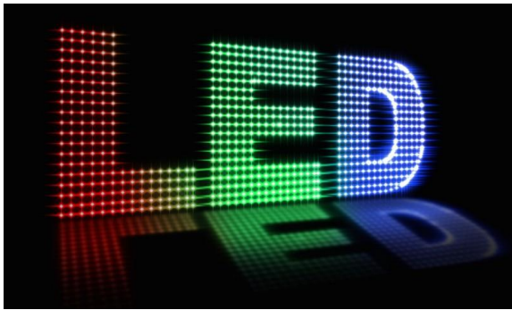
Figure 3: LED Display

Light Emitting Diode, in short LED is a semiconductor device based on the Electric Luminescence principle. It has no moving parts, only made for solid materials. So often designed into transparent body. It is commercially used device for screening the display board. When LED is supplied from its two semiconductor coated terminals then it starts emitting light without heating that reduces the problem of heating in electronic components. LED based display consist of a number of LEDs connected closely to each other. By changing the value of each LED's brightness, a image is form that is the our required output displayed on display board. The image form has brilliance light intensity. This type of display is more efficient and less power consuming. For designing a LED display board following factors should be already known such as the display type, color, size, brightness, and the number of LED required for that particular display board.