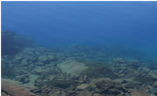
Fig 2 Input image