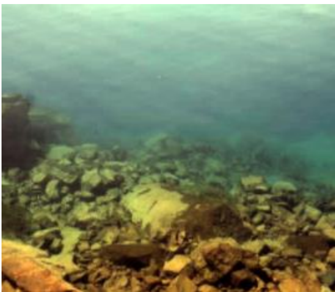
Fig 3 Enhanced output image.

Here, in the result we can observe the enhanced output image which is different from the input image. After uploading the input image on to the website by applying [7] UCM the image is enhanced and the result of the image is obtained. All the disturbances, noise, hue, colour equalization is done and the resultant clear image is shown in the output.