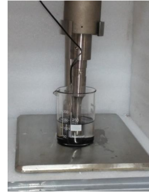
Fig 3: Sonication of graphene oxide and toluene mixture – Before sonication

graphene oxide nanoplatelets are evenly dispersed in the solvent. During sonication, the mixture in the container was exposed to ultrasonic sound at a frequency of 20 KHz. The sound waves propagated into the liquid, causing shear stress and reducing the attractive forces between the individual nanoparticles. The production of nanoparticle agglomerates is avoided with this method.