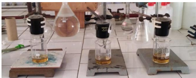
Fig 2: Filtration of Graphene Oxide

The mass is coagulated with 200 ml of ether, and the resultant suspension was filtered over a PTFE micro sieve with a 45\mu m pore size. The final filtered product was vacuum dried for 15hrs at room temperature, after drying the product mass was measured to be 5.8 g.