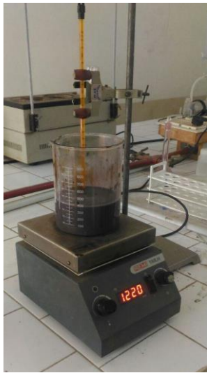
Fig 1: Magnetic Stirring of H_2SO_4 , H_3PO_4 , KMNO_4 and Graphite Flakes

The reaction was cooled to room temperature and poured onto ice (400 ml) with 30% H_2O_2 (3 ml). Later, the reaction mixture was sifted and then filtered through PTFE sieve ( 45\mu m ). The filtrate was centrifuged (4000 rpm for 4 h), and the supernatant was decanted away. The solid mass was then thoroughly rinsed with 200 ml of water, 200 ml of 30% HCl, and 200 ml of ethanol in the stated order. Repeat the rinsing process for a minimum of 4 times.