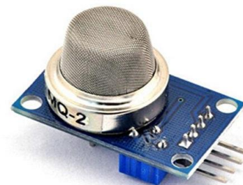
Fig: MQ-2 Sensor

Alcohol is detected using an alcohol sensor by calculating the alcohol content in the blood (Blood Alcohol Content (BAC)). Here we use an Alcohol Gas sensor (MQ3) as more cost effective and can detect alcohol between 0.05 mg/L - 10 mg/L. Material used is SnO 2 , as the conductivity is low in pure atmosphere. Conductivity rises as the alcohol increases. This sensor is sensitive to alcohol and highly resistive to the interference due to exhaust, mist and gasoline. Output is both analog / digital and can be connected with Microcontroller, Arduino and Raspberry Pi etc. This Alcohol sensor is similar to the breath analyzer as it exposes the alcohol content in breath much faster. The output is analog based on alcohol content. The circuit is simple as it needs one resistor. The plain interface can be 0-3.3V ADC.