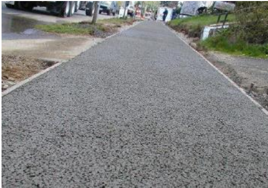
Fig-2 : Pervious Concrete Pavement 12

The Famous “Sponge City” model of China is also based on the usage of Permeable Concrete. The sponge city is a construction model of urban areas for solving problems like waterlogging, water resources shortage, drainage problems and thus to improve the ecological environment and biodiversity by absorbing and capturing rain water 5 .