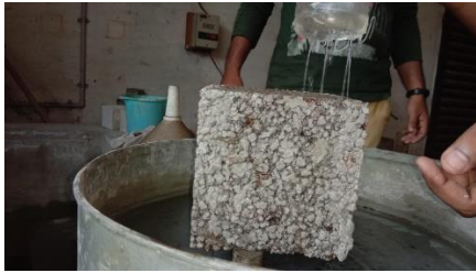
Fig-6: Arrangement of Supply of Water in the Concrete Cube

The head and rate of flow of water above the cubes were kept constant with some small arrangements using a stand and perforated bottle. Total time for the water to completely percolate through the concrete cube was recorded with the stopwatch.