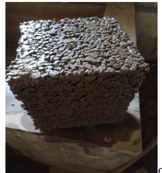
Fig-5: Permeable Concrete Cubes

a: 16-12mm aggregate used, b : 12-10mm aggregate used, c : 10-4.75mm aggregate used