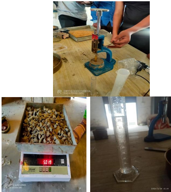
Fig-4 : Preliminary Experiments of Materials

With the results obtained from the preliminary experiments, a typical Mix design of grade M35 concrete was done in accordance with the IS 10262:2009; considering Specific Gravity of Cement to be 3 and Coarse Aggregate to be 2.78. Locally available PSC cement was considered for the experiment. No sand and admixture were considered, and all the experiments were conducted in the room temperature.