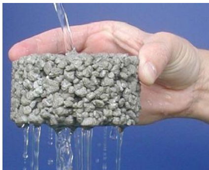
Fig-1: Permeable Concrete Block 11, 12

Permeable concrete also known as no-fines or pervious concrete is a special type of concrete having the unique property of high porosity, hence considered as a good option for ground water recharge. It allows water from precipitation and other sources to pass directly through, thereby reducing the runoff from a site and allowing groundwater recharge.