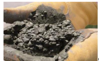
Fig-3 : Workability Assessment of Permeable Concrete Manually 12

a: Too less water added b: Proper Amount of Water added c: Too much water added