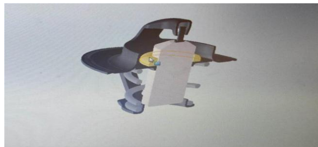
Fig-3 cross section of valve and charge cylinder

In the valve the material of charge cylinder can change beass is the proper material for the charge cylinder .with the brass the efficiency of valve is increase as well as life of valve is increase. The thermal conductivity of brass is suitable foe charge cylinder .that why the brass material we chose. Brass is having with stand capacity up to 930°C the melting point is occur of brass. The recyclation of brass is too easy or the material is reused also brass having high withstand property while machining prosses .the corrosion ratio of brass as compere to copper is high menace the charge cylinder of brass is having less corrosive property then copper. That's why the life of brass charge cylinder is increase.