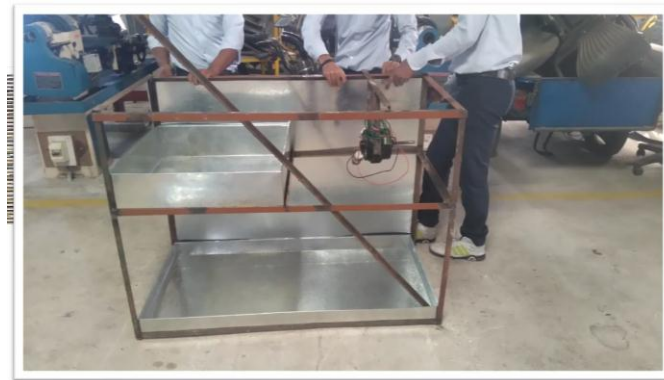
Fig -2: Framework structure of partial evaporative cooler