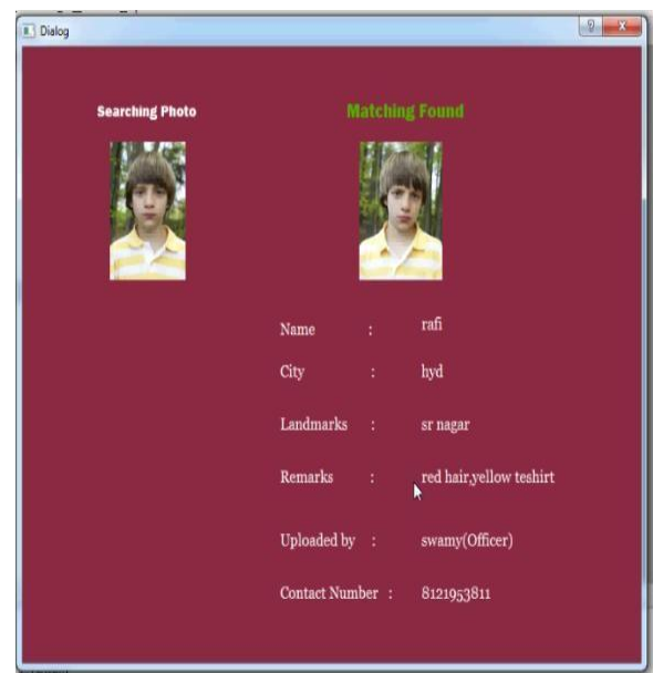
Fig5: Search Module Result