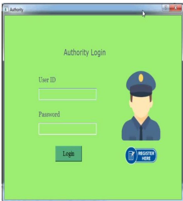
Fig3: Authority login