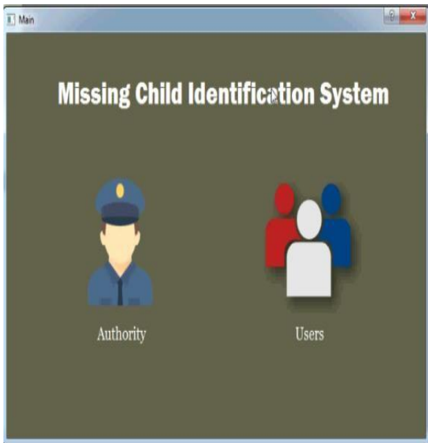
Fig2: Home Sreen