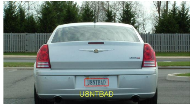
Fig.3.5. Successful recognition of characters

template matching, it may be a proficient algorithm for character recognition. The characters' image is match up to our given database and therefore the best resembling is considered. Templates will exist for all alphanumeric values which consist of A-Z and 0-9 in the database.