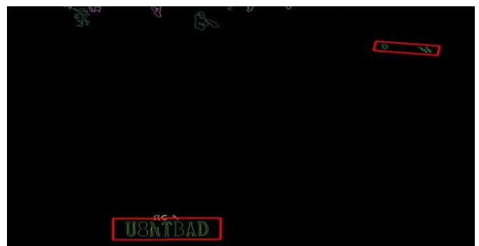
Fig.3.2.4. Vector of possible plates

By using the KNN algorithm for character recognition, we get a different number of possible plates present within the scene which is represented by the red boxes within the image.