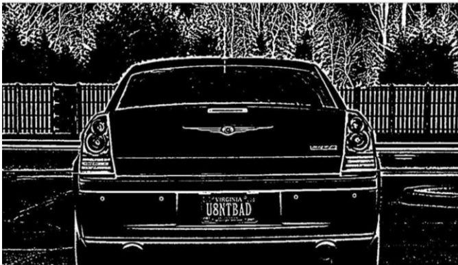
Fig.3.2.2 Thresholded Binary Image

image while ignoring the unconcerned parts. After applying the threshold, the image can be seen clearly as seen in fig.3.2.2. Thus, it becomes easy for the system to recognize characters.