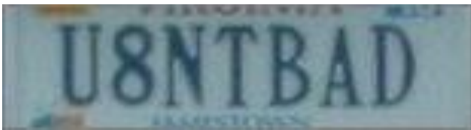
Fig.3.3. Number Plate Localization

Identification of number plate size is the main Intuition in recognition of Number Plate. Mostly number plates are rectangular. The mat lab toolbox function provides a region props function which quantifies a set of properties for each marked region in the matrix. To gauge the properties of the image region we have used a bounding box. Owing to the labelling of the associated components, the region can be differentiable from the image. Thus, the Number plate localization becomes visible.