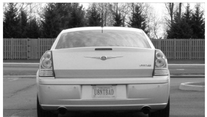
Fig.3.2.1 Greyscale Image

Segmentation is an essential and foremost step where the image is divided into several segments that have similar attributes using image segmentation. A pixel-wise mask for each object in the image is created by Image segmentation. For Character Recognition we will segment the words into individual characters which can be recognized individually. This step is important as poor segmentation can lead to misrecognition. The captured RGB image is then converted into a greyscale image. Converting a three-channel image (RGB) into a single channel (greyscale or binary image) and then a certain threshold is applied to this converted image.