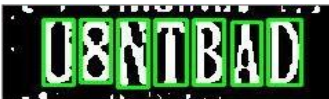
Fig.3.4. Segmented characters

Character segmentation from the localized number plate plays an important role in the system. The next step after region growing is recollecting one or more criteria that satisfy the requirements of the desired portion. Soon after setting the standards, the image is searched for any pixels that meet the requirements, and if the pixel matches, its neighbours are checked if any of the neighbours matches the necessities, both the pixels are measured and are checked against an area with an equivalent region. Vertical and horizontal scanning techniques are used to get individual character and number images. Segmented characters can be seen in fig.3.4