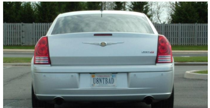
Fig3.1. Captured Image

The first step is getting an image as an input to the system. The images captured are in RGB format. Images are further processed for plate extraction. Some details such as detailed information of the vehicle, images of the license plate, and other basic data are present in the database of the system.