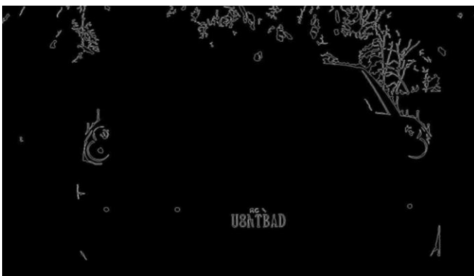
Fig3.2.3. All Contoured Image

After this, the next step is the contouring of the image. Contouring is a curve joining all the continuous points along the boundary which has the same intensity. It is used for shape and object detection. For Uniformity, all the images are resized into standard dimensions.