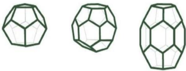
Figure 1: Structure 1, 2 and H respectively

S-H structure requires both large and small molecules to remain stable and displays hexagonal symmetry. It has 34 water molecules distributed in 3 different types of cavities viz. 3 small 512 cavities, 2 medium irregular dodecahedral cavities and 1 large icosahedral cage. The dodecahedral cavity has 3 square, 6 pentagonal and 3 hexagonal faces as the name suggests and the icosahedral cavity has 12 pentagonal and 8 hexagonal faces. The presence of these many cavities allows much large molecules(7.5-9 Å) to form the clathrates. Mainly formed by a combination of methane-neohexane, methane-cycloheptane, etc [2]