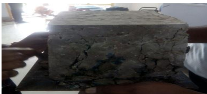
Fig -4: Cube after test