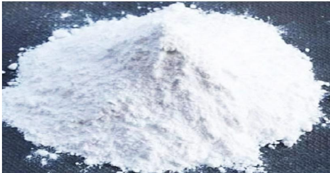
Fig -1: Nano silica powder

by M/s BEE CHEMS, Kanpur, India containing nano silica granules of size less than 40 microns was used for partial replacement of cement.