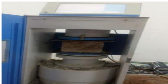
Fig -3: Cube before test

The compression test for normal and silica powder cube was carried out on 7th, 14th and 28th day and was measured in terms of MegaPascal.