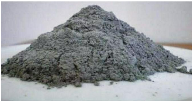
Fig -2: Fly-ash

Locally available class C fly-ash (< 100 micrometre) of sp. Gravity 2.21 was used for partial replacement of cement.