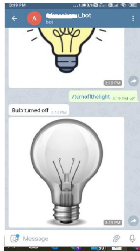
Fig 9: Snapshot of /turnofftheight command