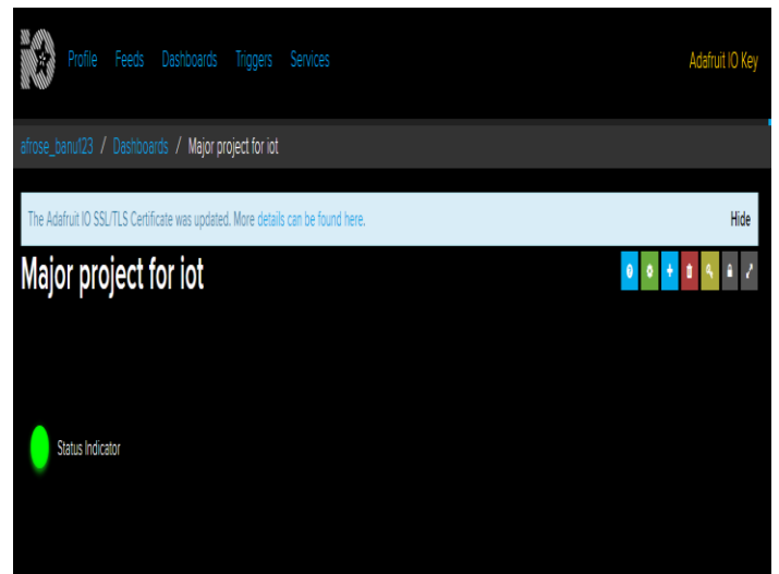
Fig 8: Snapshot of Adafruit Status Indicator as ON condition