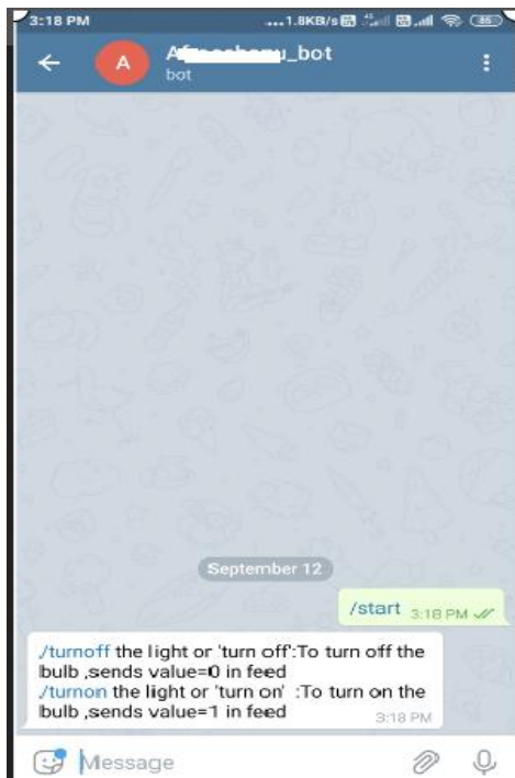
Fig 6: Snapshot of /start command