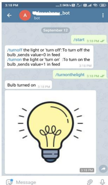
Fig 7: Snapshot of /turnontheight command