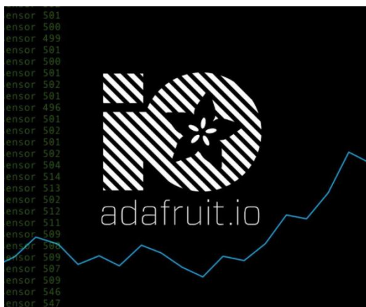
Fig 1: Adafruit.IO Logo

It's a cloud service. Display your data in real-time, online. Adafruit.io can handle and visualize multiple feeds of data. Feeds are the core of the Adafruit IO system. This includes settings for whether the data is public or private, what license the stored sensor data falls under, and a general description of the data. The feed also contains the sensor data values that get pushed to Adafruit IO from your device. Dashboards are a feature integrated into Adafruit IO which allow you to chart, graph, gauge, log, status indicator and display your data.