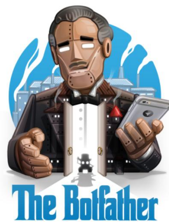
Fig 3: Telegram-Bot Father

In short, Telegram bots are applications set to perform specific functions, follow instructions, and interact with users. Bots run inside the Telegram environment and do not require an additional installation procedure. By using bots, people can enhance the functionality of Telegram. For instance, you can send daily notifications to your friends, set reminders for yourself, translate messages, receive weather alerts, play games, and so much more.