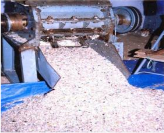
Figure 2. Collection of waste Plastic

Sprinkled plastic waste was sprinkled over hot condensed compounds when dissolved. The size of the cover varies by using different percentages with plastic. The increase in the percentage of plastic increases the integration properties.