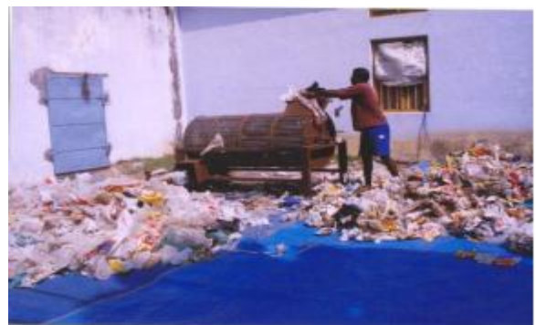
Figure 1. Collection of Waste Plastic

Plastic waste such as carry bags, cups, disposable items, etc. extracted from the mill and sprayed with different percentages above the hot mixture. Details of the process are provided below.