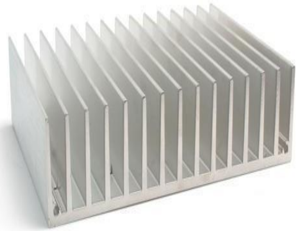
Fig-1 Simple Exploded view of Rectangular heat Sink